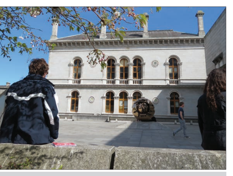
The Museum Building